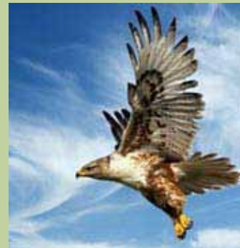
Eagle Dream Birds Of Prey

Phone: 814-968-9144 wildwoodsanimalpark.com